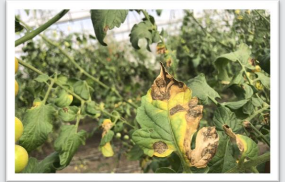
Figure 1: Early Blight https://croipaia.com/blog/early-blight-of-tomato/