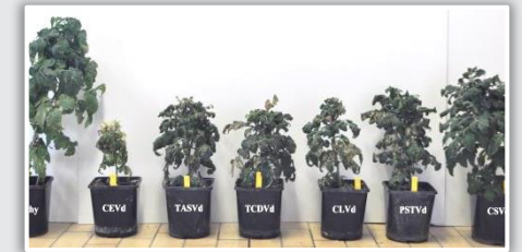
Fig 1: Viroid symptoms on tomato plants.

Check your production site frequently for the presence of new pests and unusual symptoms. Make sure you are familiar with common pests of your industry so you can recognise something different.