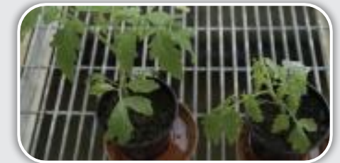
Figure 3. Infected plant on right showing slight leaf discoloration.