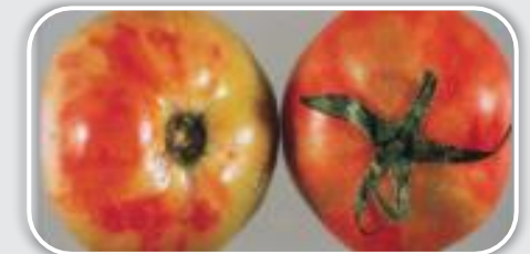
Figure 2. Tomato fruit symptoms showing uneven ripening and surface 'marbling' (left), healthy with normal appearance (right).