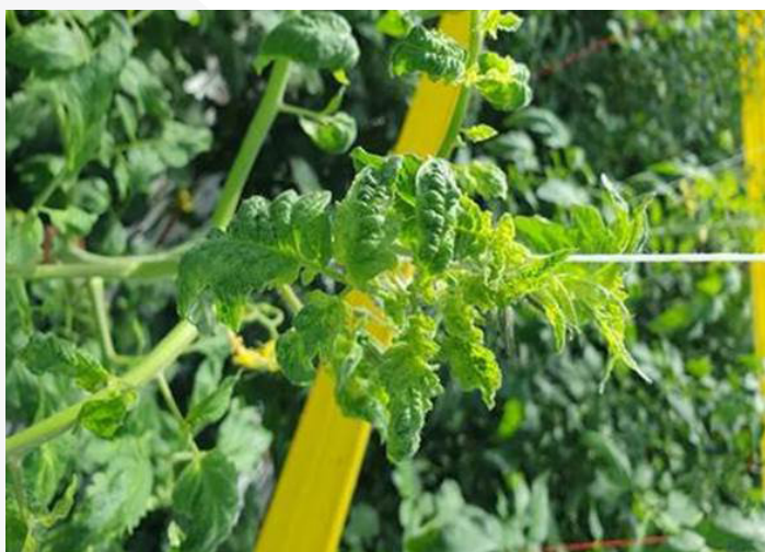
More advanced symptoms.